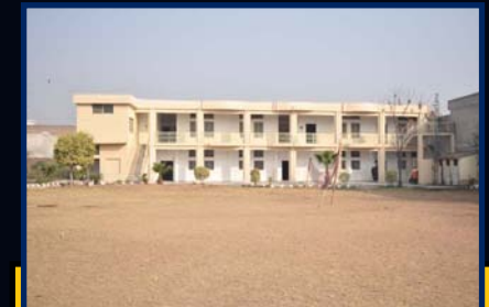
Al-Hammad Campus Location: Thanda Pani Classes: Nursery to 8th Dimension: 60,000 Square Feet Rooms: 13 Bright & Well Ventilated Rooms