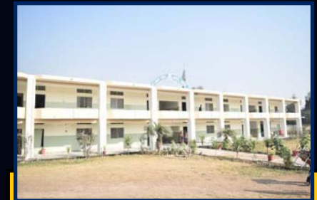
Al-Hamza Campus Location: Burma Town Classes: Nursery to 10th Dimension: 43,520 Square Feet Rooms: 28 Bright & Well Ventilated Rooms