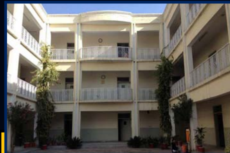
Al-Hadayat Campus (Senior) Location: Tarlai Kalan Classes: 2nd to Intermediate Dimension: 13,600 Square Feet Rooms: 37 Bright & ventilated Rooms