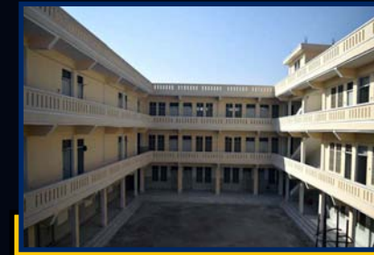
Al-Waris Campus Location: Panj Garan Classes: Nursery to 7th Dimension: 13,612 Square Feet Rooms: 39 Bright & Well Ventilated Rooms