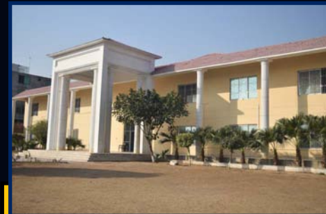
Al-Mehrban Campus Location: Park Road Classes: Nursery to Intermediate Dimension: 43,560 Square Feet Rooms: 30 Bright & well ventilated Rooms.