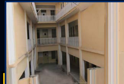
Al-Haider Campus Location: Taramri Classes: Nursery to 5th Dimension: 8,160 Square Feet Rooms: 28 Bright & Well Ventilated Rooms