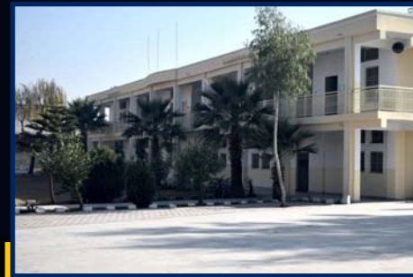
Al-Amna Campus Location: Tarlai Kalan Classes: Nursery to 7th Dimension: 65,280 Square Feet Rooms: 50 Bright & Well Ventilated Rooms