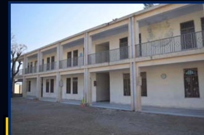
Al-Ibraheem Campus Location: Jabbi Ali Pur Classes: Nursery to 7th Dimension: 32,640 Square Feet Rooms: 25 Bright & Well Ventilated Rooms