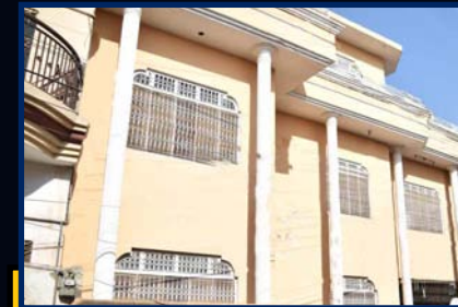
Al-Hadayat Campus (Junior) Location: Tarlai Kalan Classes: Nursery to 1st Dimension: 2720 Square Feet Rooms: 16 Bright & ventilated Rooms

AIMSC has the privilege of grooming Iqbalians (Students) who are going to become true Muslims, patriotic Pakistani and productive member of society in fact become the backbone of the country.